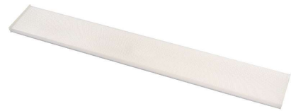
Wraparound 30W / 35W / 40W

The TWP LED wraparound is a contractor experience lighting solution designed to save you money, save you time, and install quickly. 3 selectable lumen outputs for different ceiling heights/applications and 3 selectable CCT color outputs. Lightweight for easy installation - engineered with your experience first.